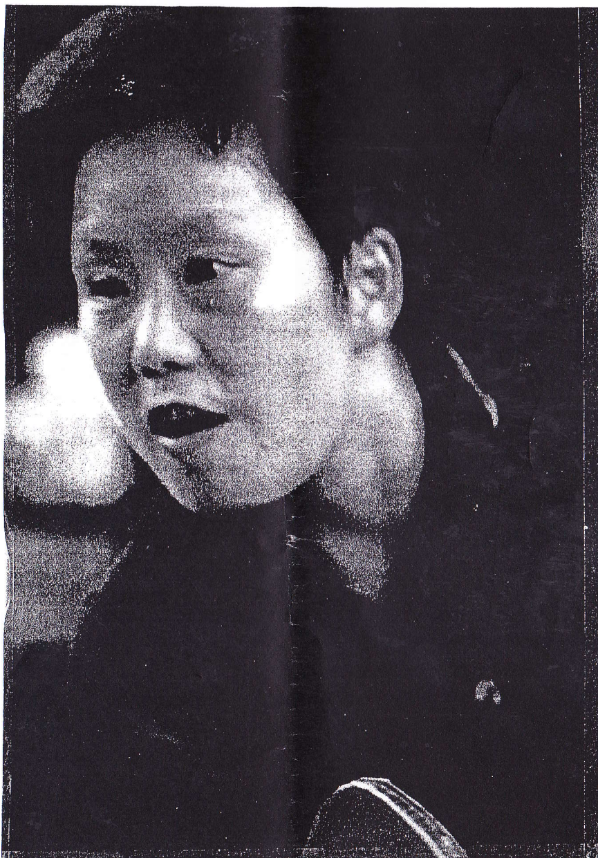
LI CHUNLI, the Commonwealth champion at 40 and still climbing the world rankings.