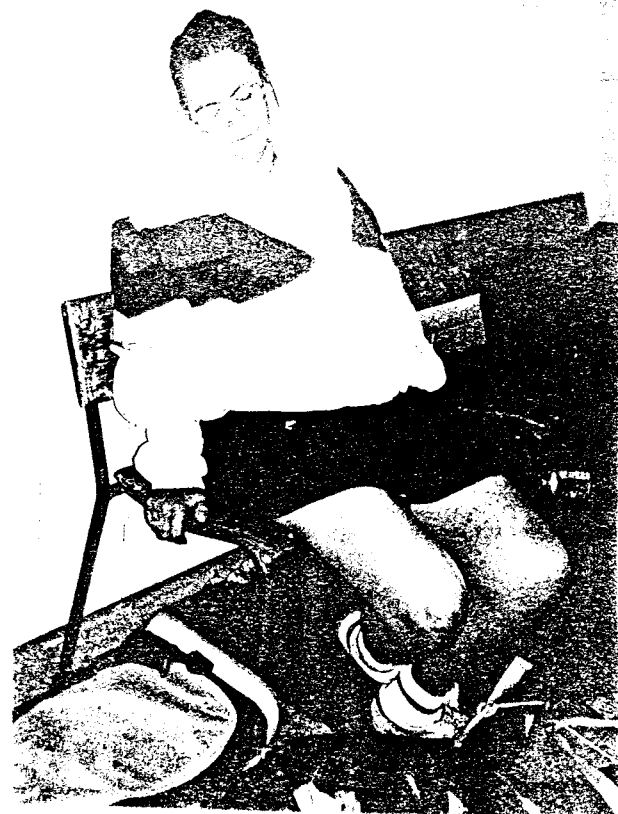
Preparing herself for a big match in Doubles against the Top Seeds.