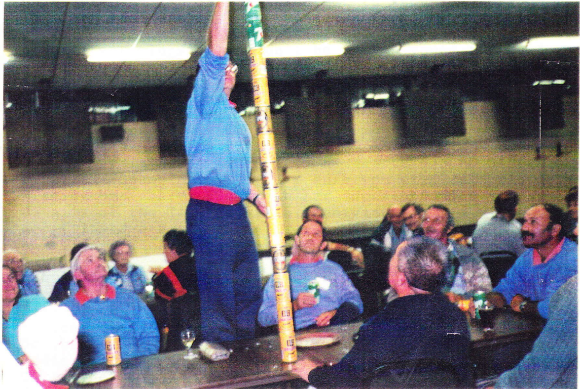
A few cans of beer and Waitemata reach an all time high

Memories of Palmerston North and the 3rd Veterans Championships