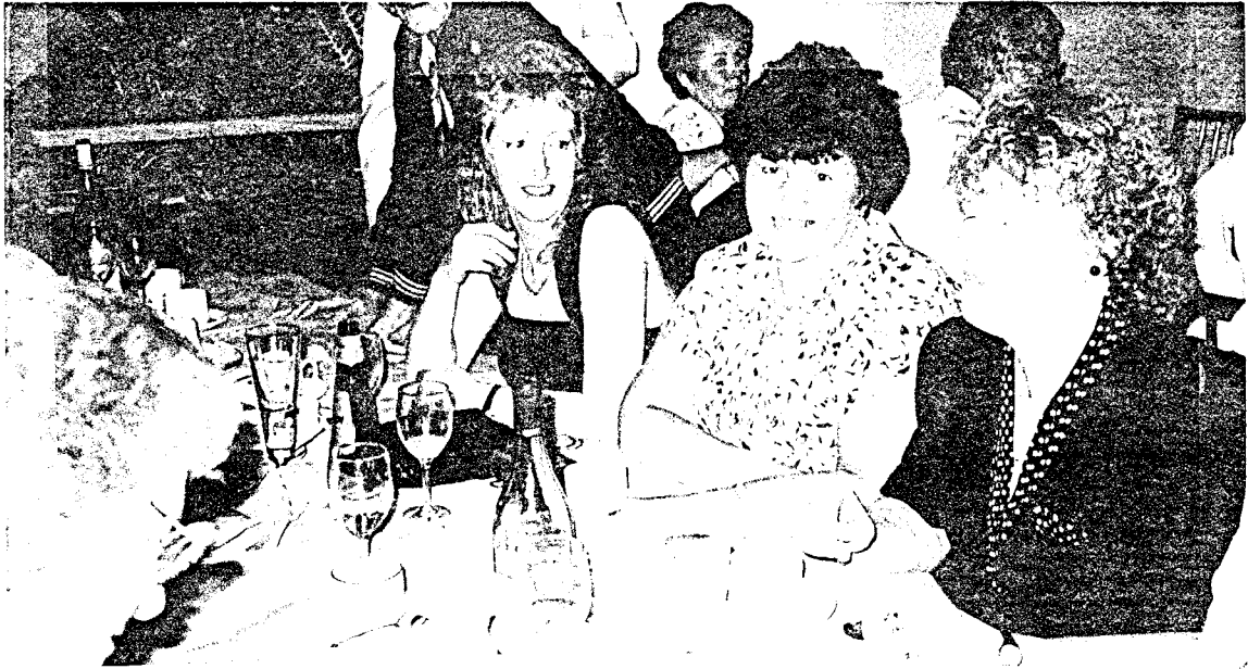
OVER 40 WOMENS TEAM CELEBRATES