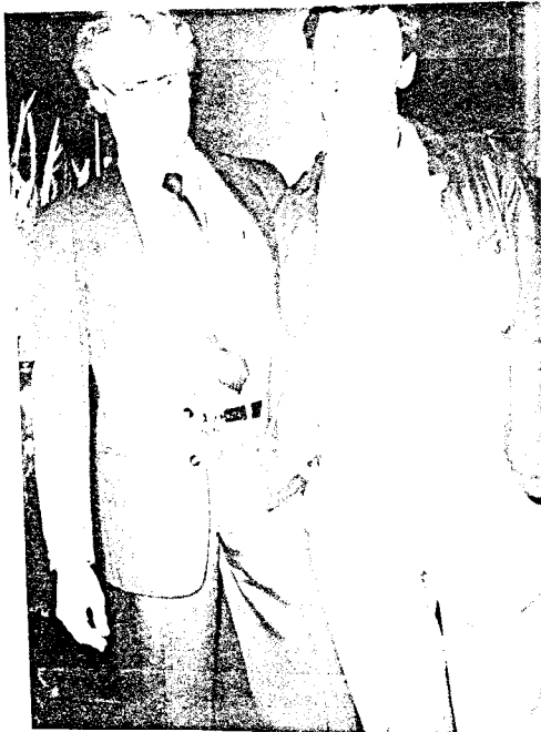
LASSEN BROTHERS COLLECT BRONZE