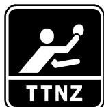
Table Tennis New Zealand – YOUR sports body P O Box 867 Wellington Ph: (04)-916-2459 Fax: (04) 471-2152 E-mail: ttnz@tabletennis.org.nz http://www.tabletennis.org.nz

Entries Close Thursday, March 20th 2003 Send entries to Table Tennis NZ, P.O. Box 867, Wellington