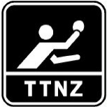
Table Tennis New Zealand