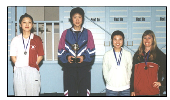
The final four in the Women's Singles at the NZ Open.