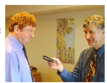
The Keys are handed over!