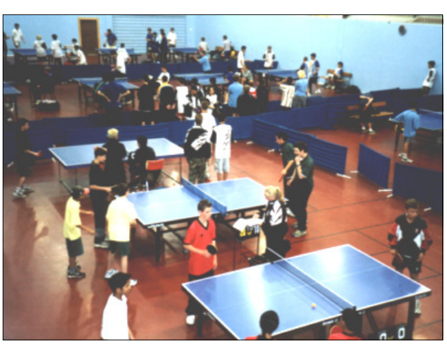
The busy North Harbour Stadium during the Championships

A record 43 teams entered the tournament, played in North Harbour stadium on 26/27 September. The open secondary event attracted the strongest line up of school teams ever assembled in NZ. Testimony to the depth was that defending champions (St. Kentigern College, Auckland) were only able to manage 4th place with the same team as last year.