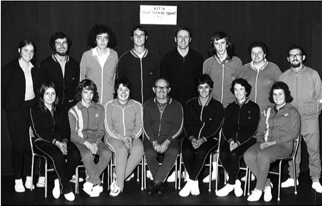
1973 NZ Senior training squad (Champions all)