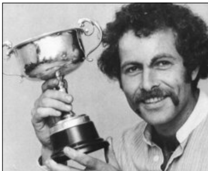
1981 NZ Player of the Year