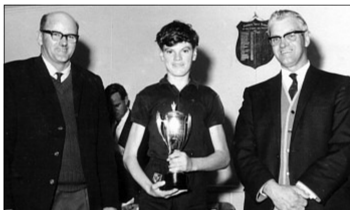
Presentation Flint & Ward Memorial Trophy National Coaching School 1969