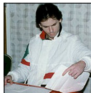
1993 - working at NZ Open