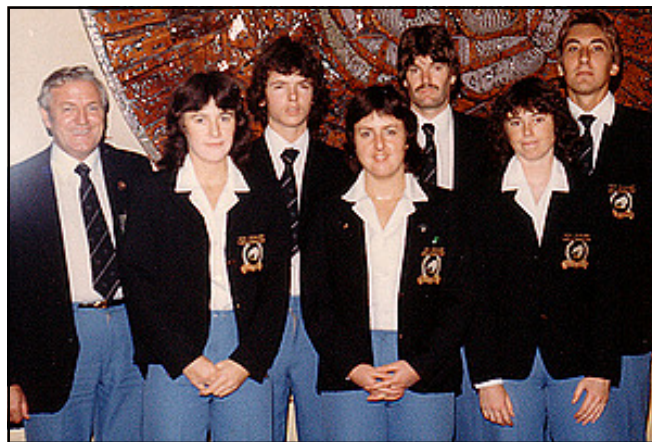
NZ team to World Championships, Yugoslavia - 1981